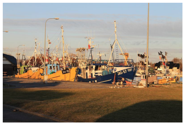
Photos: Piotr Mądry (front, inner 3 top), Hotel Dom Zdrojowy, Jastarnia (back), M. Bizewski (inner 1, inner 3 bottom), Marcin Jagiellicz (inner 2); Maps: Google Maps; Text fragments on location: Wikipedia

Hel Peninsula is a part of the Puck County of the Pomeranian Voivodeship, and located close to the metropolitan area of the Tricity: Gdynia, Sopot and Gdansk, with more than 1 million inhabitants, for many of which it serves as a recreational refuge.